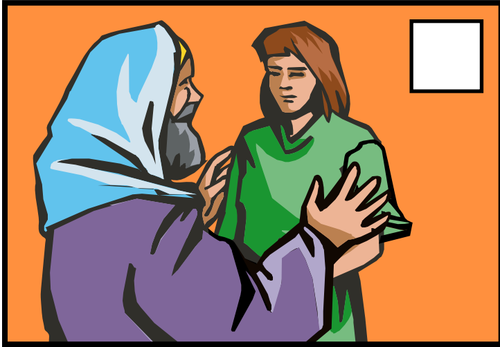
The Prodigal Son's Father lovingly welcomes him home.

On the lines at the bottom of the page, write about a time when you forgave someone or were kind to someone who made a mistake or was acting in an unkind way.