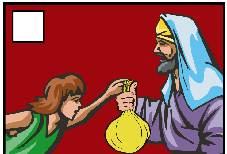
The Prodigal Son demands his inheritance.