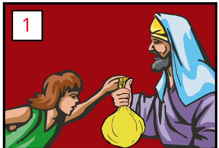
The Prodigal Son demands his inheritance.