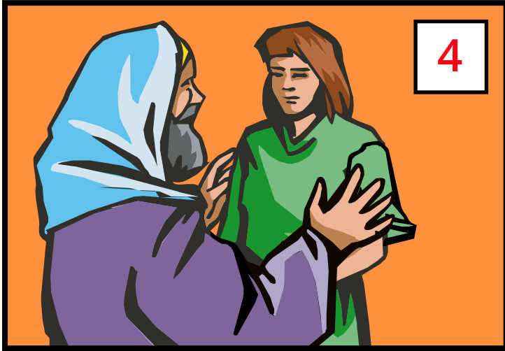
The Prodigal Son's Father lovingly welcomes him home.

On the lines at the bottom of the page, write about a time when you forgave someone or were kind to someone who made a mistake or was acting in an unkind way.