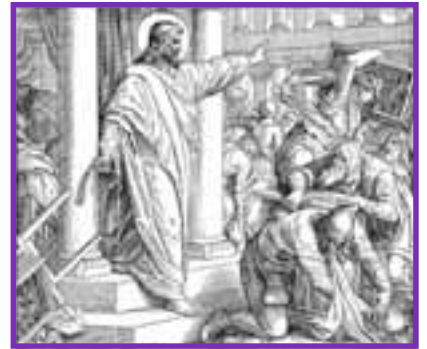
Clearing the Temple of Money Changers