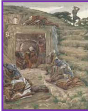
Guards Watching Jesus' Tomb