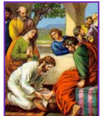
Washing Disciples' Feet