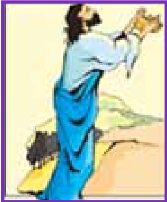
Day of Prayer

Which day of the week did these events happen? Write the correct day of the week under the picture of the event.