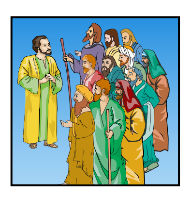
Joseph & his brothers

Describe a time when you had a disagreement with a friend or family member, and how you were able to work with them to resolve the disagreement.