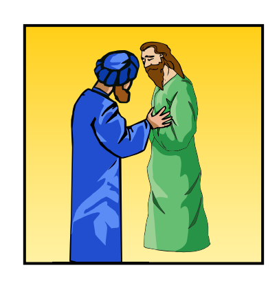
Jacob and Esau